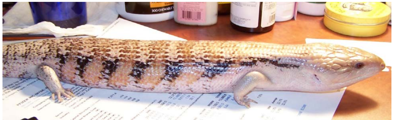
Sluggo, my cuddly hypomelanistic blue-tongue skink

The slug, I suppose, spends her days (her, for I find myself calling the hermaphroditic mollusk Slugette, not to be confused with Sluggo, my blue-tongue skink) living somewhere in the wall behind the guest bathroom cabinet, or perhaps on or under the ground under the bathroom, sliming her way back and forth to her favorite indoor cruising ground, the hallway and den in my house.