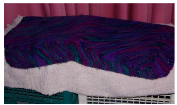
The slight bump just to the left of center is a sign that Sluggo is there.