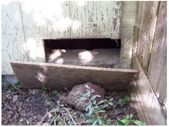
The Thing's door

The air space under the house is ventilated (theoretically) by small openings cut into the building that are covered by sturdy wire mesh. All but one of the openings is in fact so covered. The one that isn't has provided access, according to the neighborhood kids who have had the opportunity to observe such access, to the rabbit who escaped from his pen next door, a "rat that was THIS biiiiig!" the occasional skunk and, presumably, opossums, cats, and a variety of rodents.