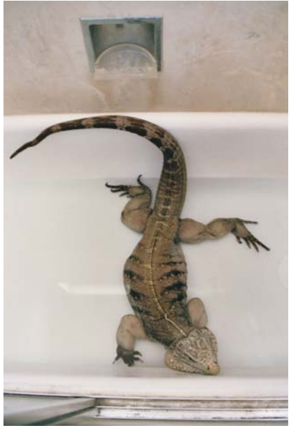
Widdle iguana mode

Iguanas get bathed daily most of the time, and are quite able to get in and out of the tubs themselves. But sometimes they get a little needy in the attention department, and will scratch feebly and pathetically on the tub, their way of saying "I'm a poor widdle igwana who can't get out of the tub please come help me before I slide down the draaaaaaaaaain."